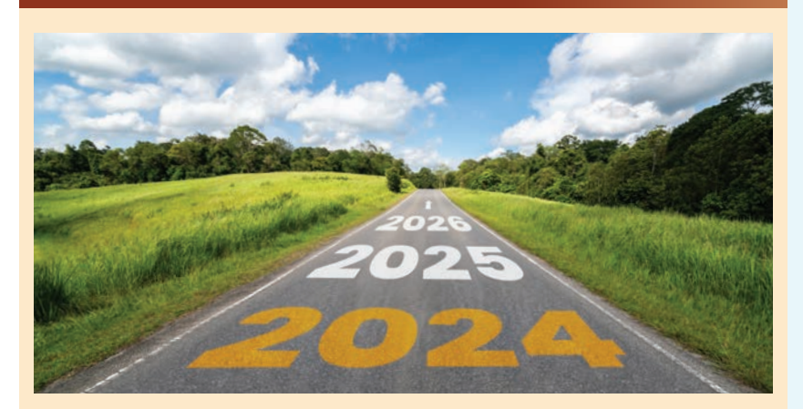
Beware of upcoming changes to catch-up contributions

The SECURE 2.0 Act, signed into law Dec. 29, 2022, builds on the 2019 Setting Every Community Up for Retirement Enhancement Act. SECURE 2.0 makes major changes in a variety of areas that affect retirement planning, many of which have already gone into effect. But there are a couple of big changes looming for some taxpayers: